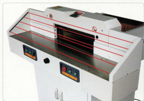
Safety beam guards