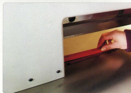
Cutter pat raised easily design